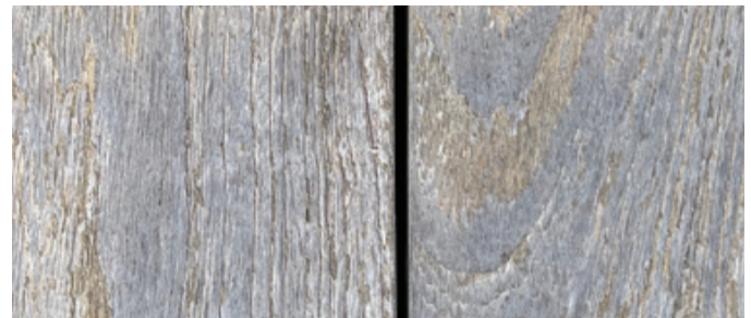
Advanced weathering (most finish worn away)

Painted teak furniture with our Vintage finish can be maintained by using our Vintage Retouch & Refinish product, or by simply allowing the finish to weather away naturally and form a silver-gray patina. Please be aware that because the factory-applied Vintage finish is multilayered, it cannot be replicated with the Vintage Retouch & Refinish product; rather, this product will only approximate the original finish.