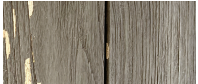
Partial weathering (some unpainted teak exposed)